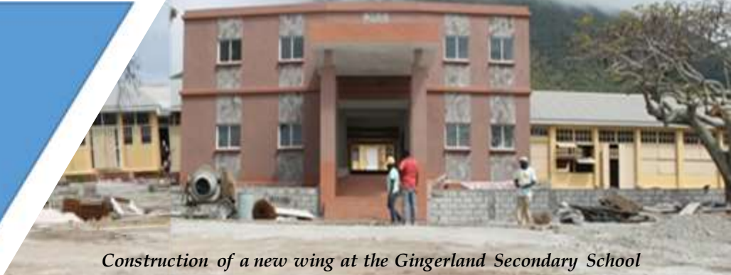
Construction of a new wing at the Gingerland Secondary School