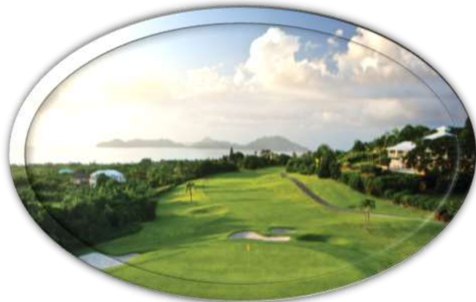
The Four Seasons Golf Course