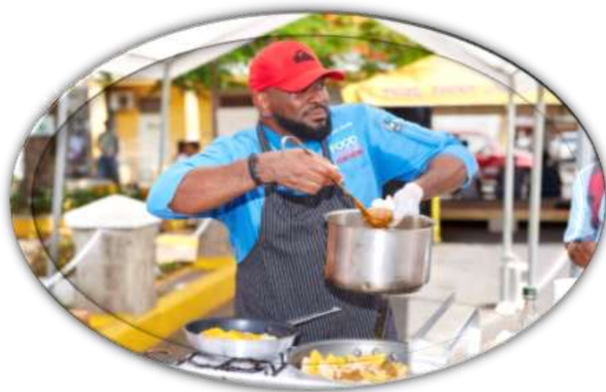
Nevis Mango Festival