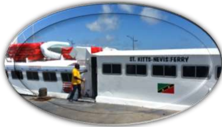
M V Caribe Queen docks at Charlestown Pier