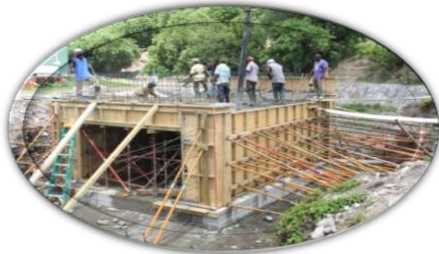
Construction of the Bath Bridge in St. Johns' Parish