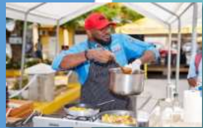
Nevis Mango Festival